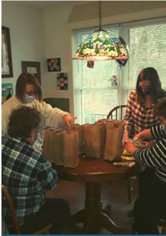
TVS supported residents decorate bags of popcorn!

On Feb 12, Tim Tebow's 'Night to Shine' prom virtually aired its 17th annual event. TVS supported residents decided to "dance the night away" in their pajamas instead of the traditional tiaras and bow ties. Viewers were greeted with paparazzi and a red carpet, got to dance-along with Demi Tebow, and also had messages from special guest appearances throughout the night. We invite you to learn more at https://www.timtebowfoundation.org/ministries/night-to-shine