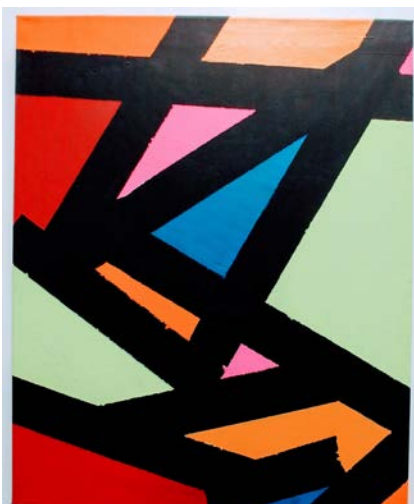
The Art of Sunshine

Last year, 'No Limits' artists were accepted into this annual show with the collectively created art piece, No Limits. Art Unblocked is a part of Arts Access' A Series of Fortunate Events (SOFE). It is dedicated to making the arts accessible to children and adults with disabilities. The 'No Limits' artists are not selling the submitted artwork at this time. Please enjoy the exhibit at: https://sites.google.com/artaccessinc.org/artunblocked2021online/home