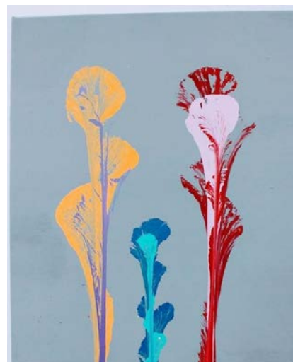
Bach in D Minor